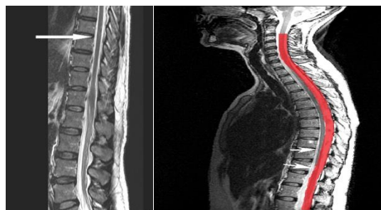
Figure 1.0 Spinal Cord MRI Image Sample

Spinal cord segmentation is become an important process for automatic interpretation and analysis. But the spinal cord segmentation has several challenges and issues. The shape of the spinal cord is apparently simplistic, but the segmentation can be much complicated due to the improper formation of tissue intensities, image quality oriented issues.